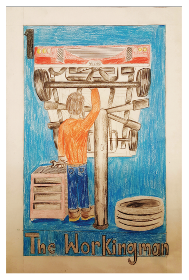
Student re-created Lotería card.

machismo because it reinforces gender stereotypes that some students lamented were reflected in their homes. One student felt that the image of El Valiente was not aligned with his interpretation of being brave. He thought his dad was an authentic Valiente and wanted to challenge this visual narrative of a macho looking man with a knife. He explained: