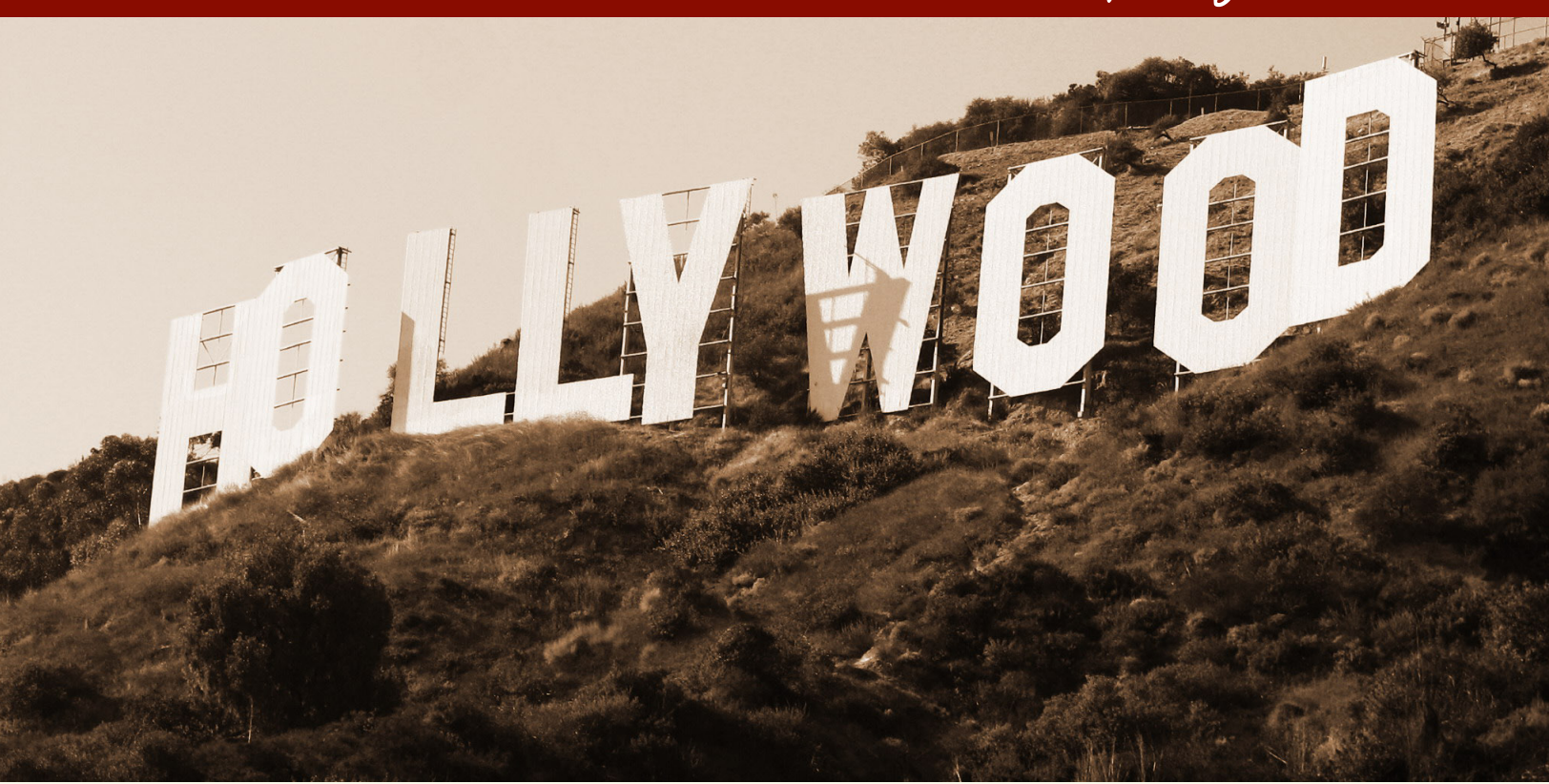
People in the United States