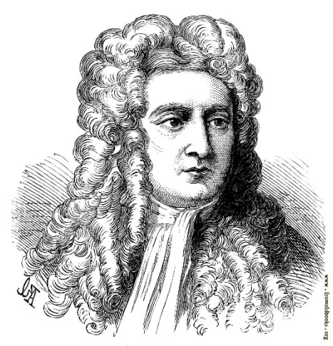
Sir Issac Newton