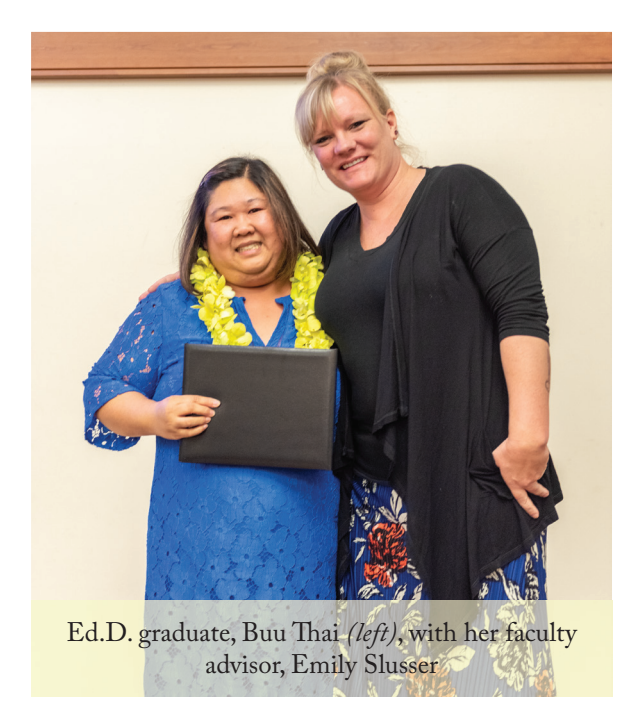
SJSU | CONNIE L. LURIE COLLEGE OF EDUCATION