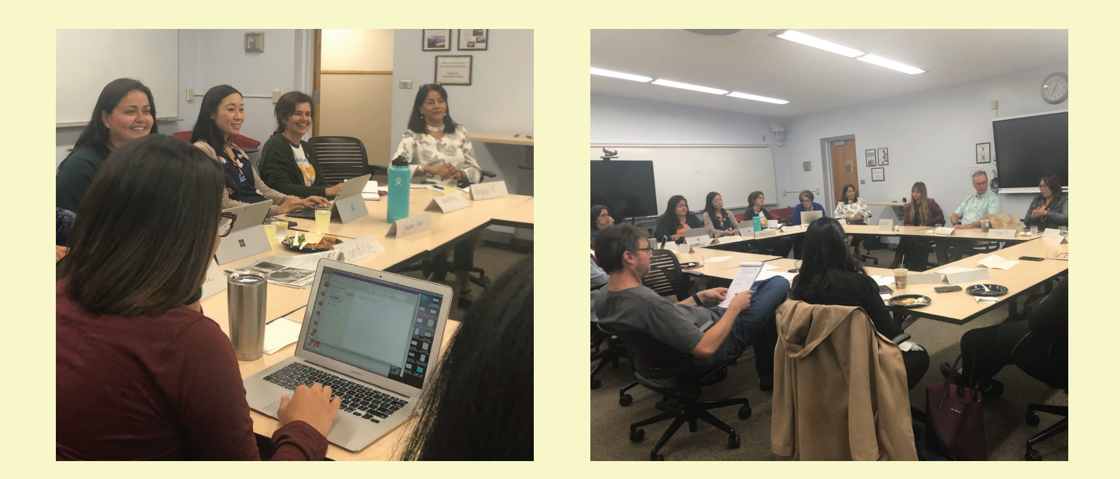
Ed.D. students listen to a panel of program alumni, at a Dinner & Discussion event in October, describe their experiences preparing their dissertations and strategies for successfully completing the program.